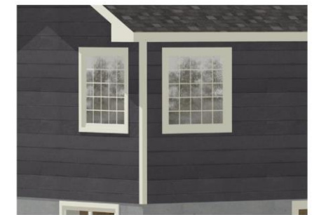
2 large textured glass windows in the Master Bath